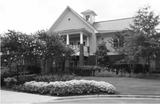
Family Circle Tennis Center Building on Daniel Island